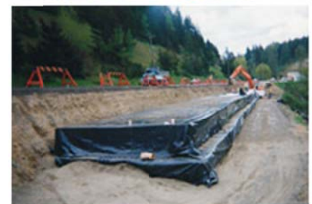
Figure 3 - Installation of GeoSpec Lightweight fill Material